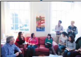
Masters Student Handbook