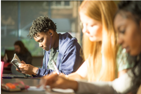
Undergraduate Student Handbook

We hope that you will find all the information that you need. However, if you cannot locate something that you are looking for, or you find any broken links, please contact us.