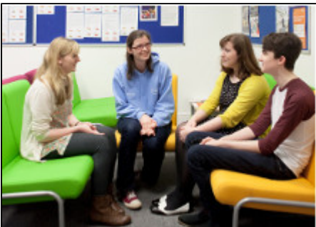
Undergraduate Community Page